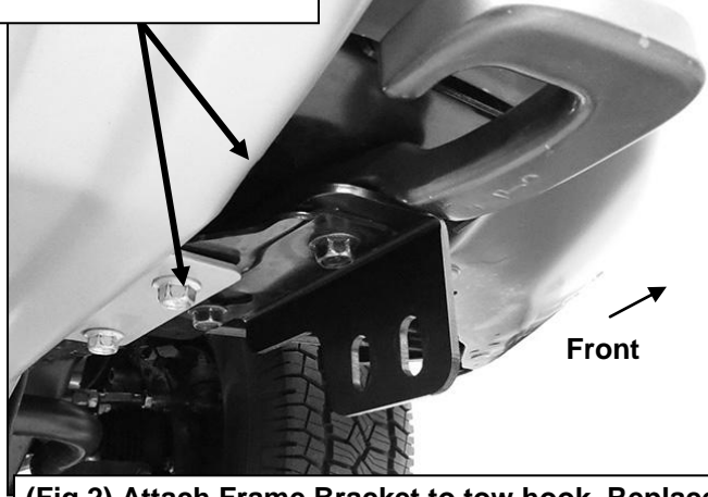
(Fig 2) Attach Frame Bracket to tow hook. Replace hardware with supplied longer 12mm Fine Thread Hex Bolts, Lock Washers and Flat Washers.