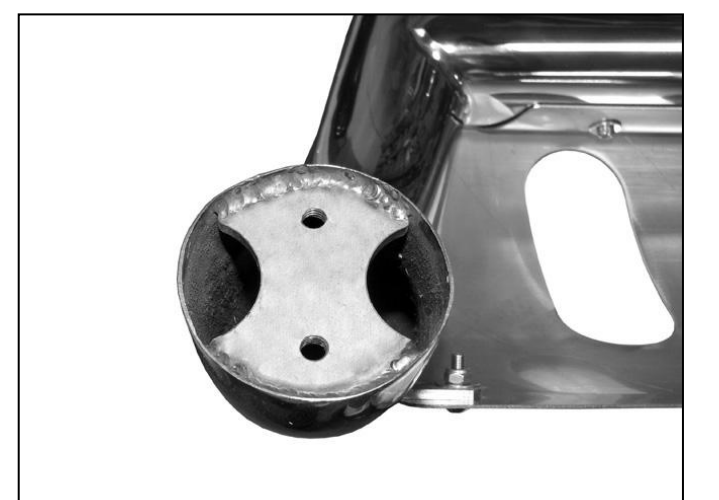
(Fig 3) Driver side of Bull Bar pictured